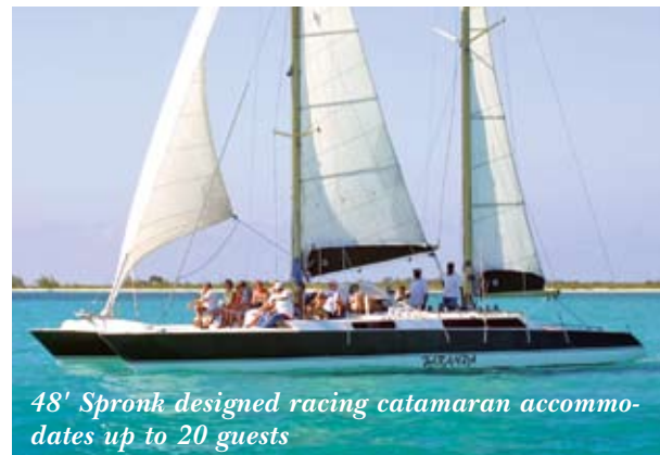
48' Sprunk designed racing catamaran accommodates up to 20 guests

Lunch is served at the Big Bamboo restaurant at Loblolly Bay. This is a great opportunity to have lobster! A GREAT opportunity to have lobster! The lobster, when in season, is caught fresh that morning, just off the beach.