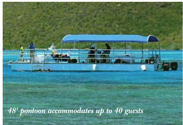
48' pontoon accommodates up to 40 guests