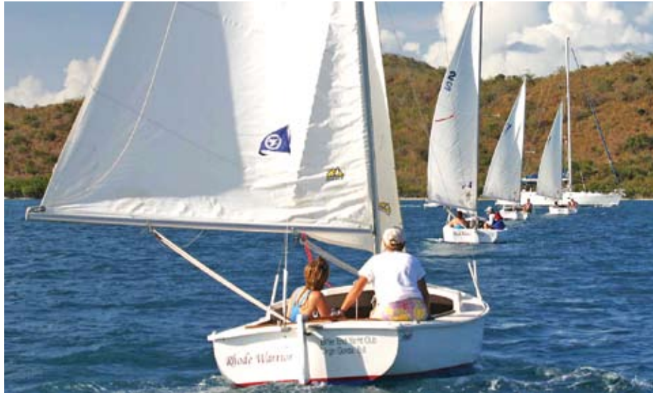
Participants showing off their skills

Bitter End's 17th annual week for women combines exceptional hands-on instruction with superb shoreside activities for a one-of-a-kind experience. Sailing instruction covers all aspects of skippering, sail trimming, sail changing, crewing and teamwork, as well as overboard recovery techniques, sailing smart, downwind sailing and racing.