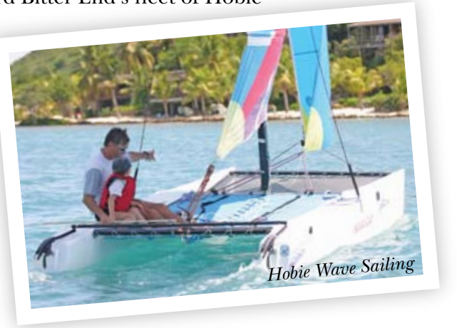
Hobie Wave Sailing

Join us! Visit the web site to see a schedule of activities, www.beyc.com , and contact our Reservations and Information Office to start planning your visit: 800-872-2392, 312-506-6205; binfo@beyc.com .