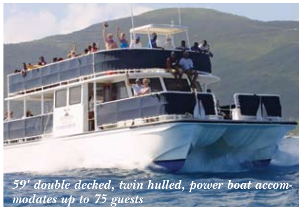
59' double decked, twin hulled, power boat accommodates up to 75 guests