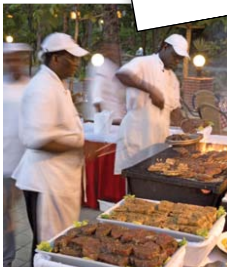
Almond Walk barbecue

Contact our Special Events Office: 203-656-0799 or visit www.beyc.com