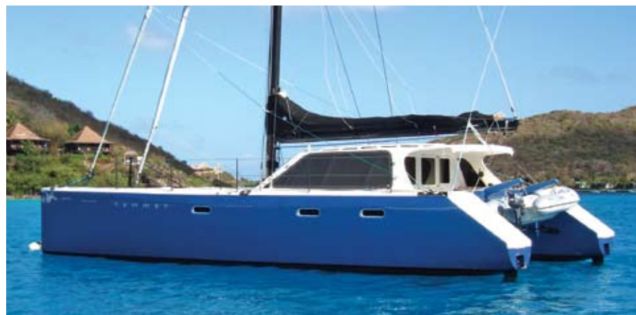
Hammer, a Gunboat 48

If you've been out on the water in the past few years, cruising or racing, and been overtaken by what looks like a catamaran's catamaran – deep hulls, hulky body designed for comfortable interiors, but amazingly quick and agile – you've no doubt crossed paths with a Gunboat.