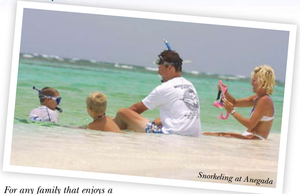
Snorkeling at Anegada

For any family that enjoys a little active adventure at the beach or on the sea, Bitter End is the ultimate family vacation destination.